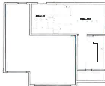
Lower Level: 875 Sq. Ft.