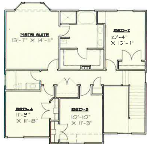
Upper Level: 1063 Sq. Ft.